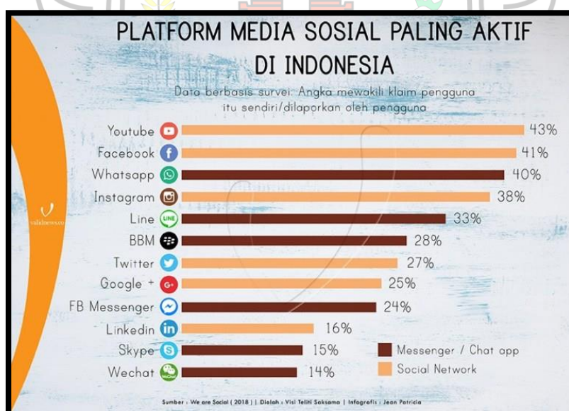
FIGURE 2. Most Popular Social Media in Indonesia, 2018

The existence of this technology certainly opens our eyes to the fact that distance is not a barrier anymore, it is different from the conventional method which was very complicated and cost more to market. Likewise, marketing techniques with the help of technological media create no geographic boundaries. Since the entry of this technology, there have been various new ways to market and promote a product or service, such as by using social media. In more detail, the usage of social media in Indonesia is shown in the following figure.