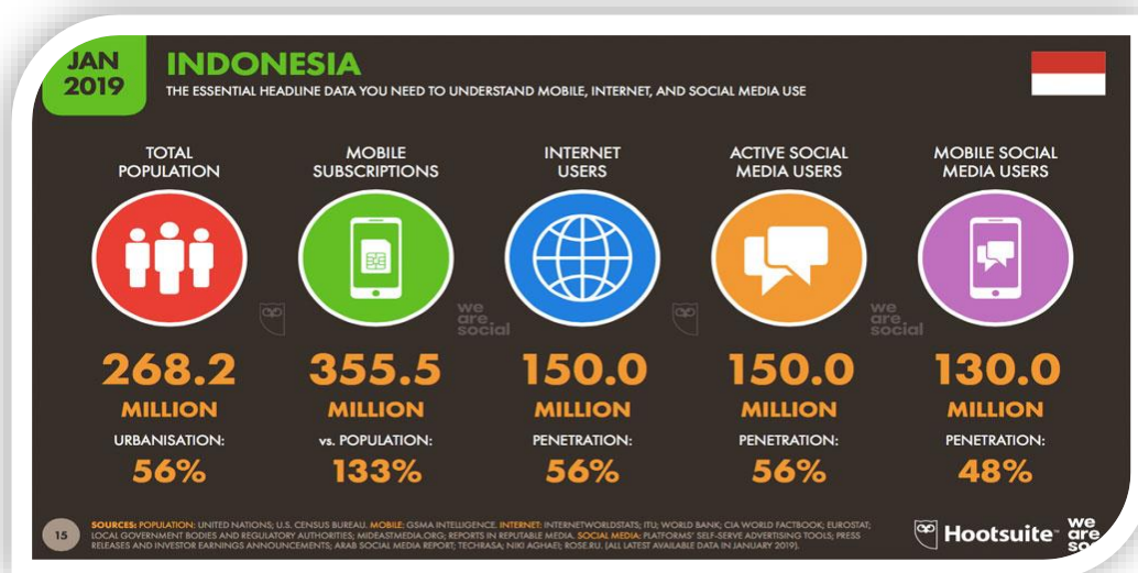
FIGURE 1. Total Indonesian Population Using Social Media

The existence of this technology certainly opens our eyes to the fact that distance is not a barrier anymore, it is different from the conventional method which was very complicated and cost more to market. Likewise, marketing techniques with the help of technological media create no geographic boundaries. Since the entry of this technology, there have been various new ways to market and promote a product or service, such as by using social media. In more detail, the usage of social media in Indonesia is shown in the following figure.