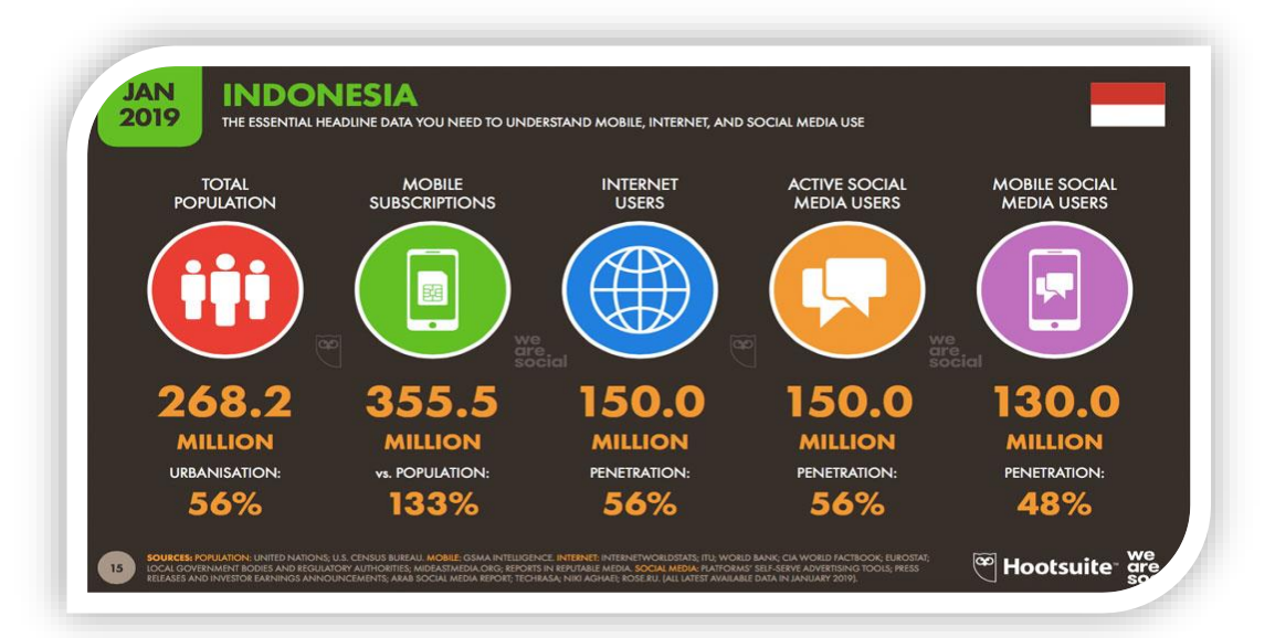
FIGURE 1. Total Indonesian Population Using Social Media

The existence of this technology certainly opens our eyes to the fact that distance is not a barrier anymore, it is different from the conventional method which was very complicated and cost more to market. Likewise, marketing techniques with the help of technological media create no geographic boundaries. Since the entry of this technology, there have been various new ways to market and promote a product or service, such as by using social media. In more detail, the usage of social media in Indonesia is shown in the following figure.